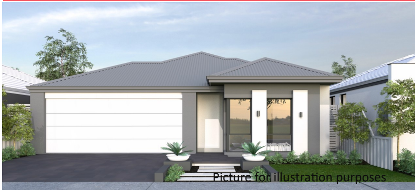
Picture for illustration purposes